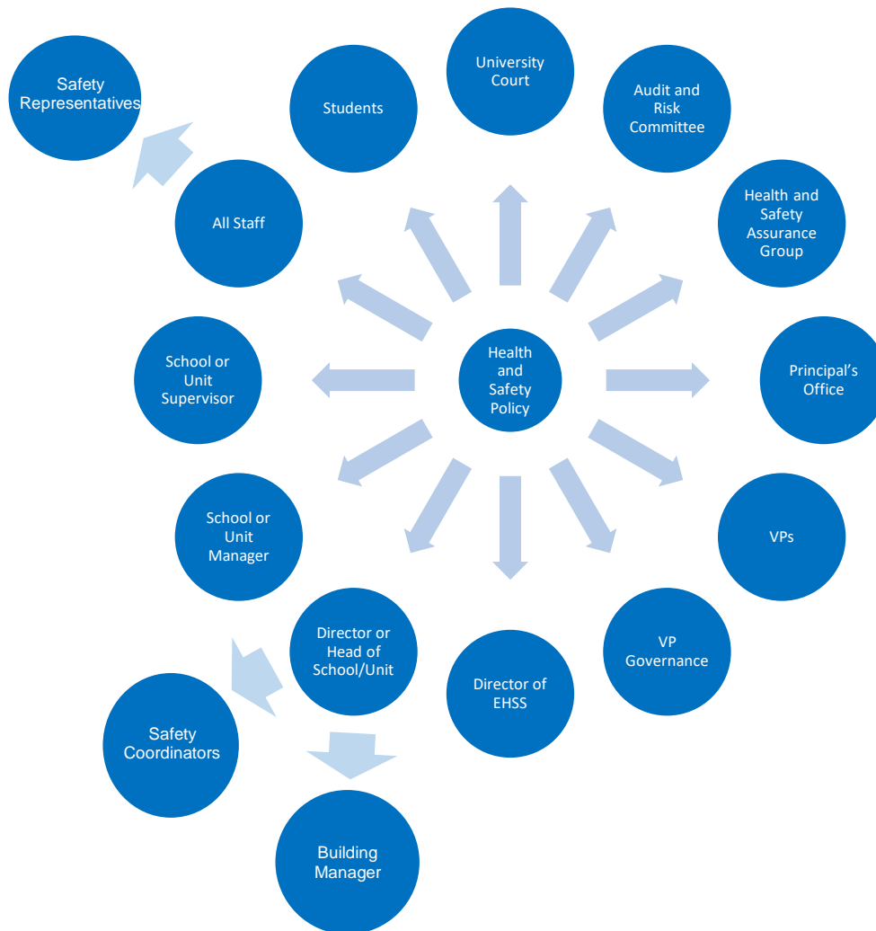
Diagram 1 – Health and Safety Responsibilities