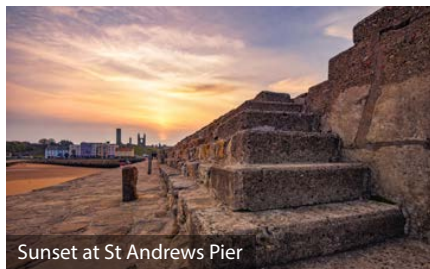
Sunset at St Andrews Pier