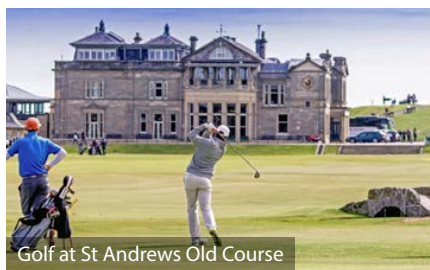
Golf at St Andrews Old Course