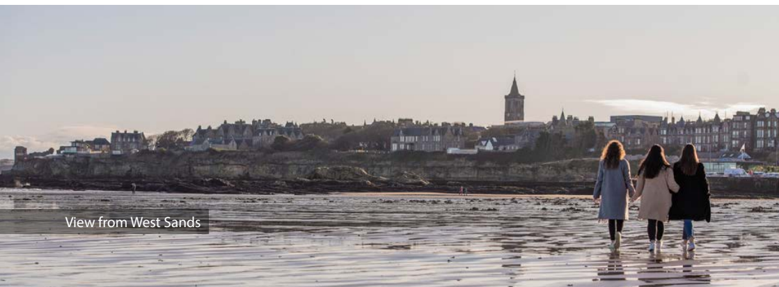
View from West Sands