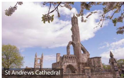
St Andrews Cathedral

Explore the town's wide range of boutique shops, museums and galleries, cafés and restaurants. Enjoy a long walk across the West Sands or visit the iconic stone pier at East Sands for an unforgettable view.