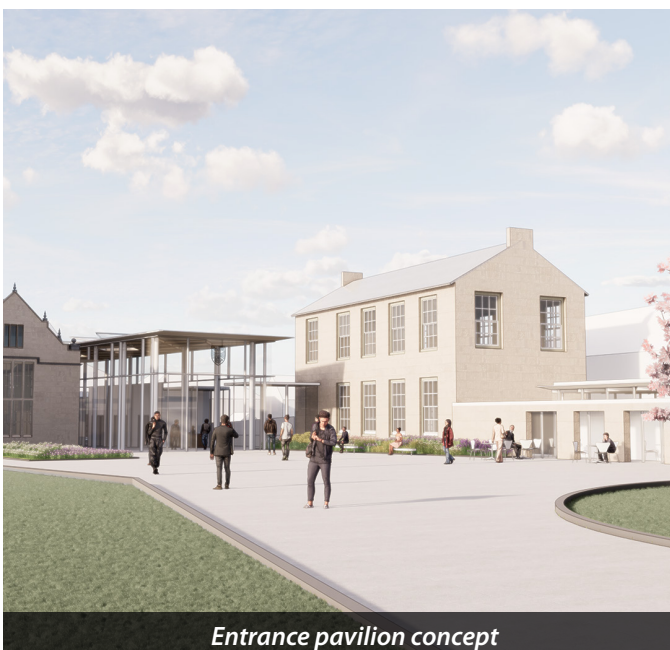
Entrance pavilion concept