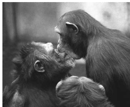
The kiss: chimpanzee communication is based on interactions, according to dynamic systems theory.

By isolating and formally defining a quantity termed information, which has surprising affinities to the physicists' concept of entropy, Shannon and Wiener planted the seeds of today's digital world, where diverse types of information can be transformed, stored or transmitted as a pattern of binary digits (or 'bits', a term they introduced). Shannon and Wiener were acutely aware that information (a measurable quantity of signals) is not to be confused with meaning (which depends on context and interpretation, and exists in the eye of the beholder). They both explicitly set aside 'meaning' as a topic for future work, and it remains formally undefined today.