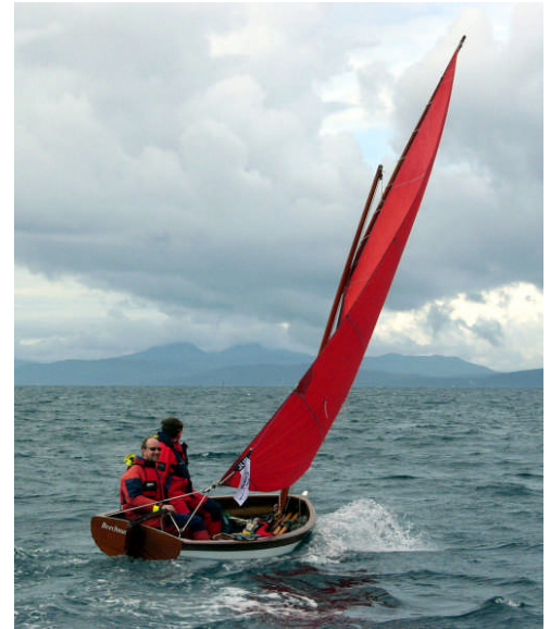
Beechnut heading towards Jura.

You can find more pictures and information about the event at www.crinanclassic.com