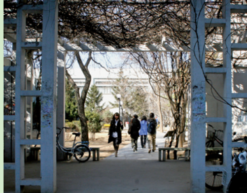
Beijing Foreign Studies University