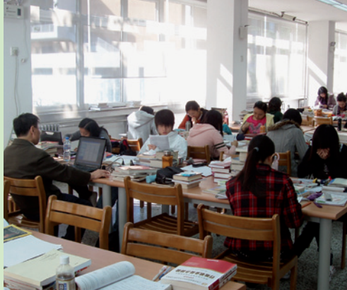
Beijing Foreign Studies University Library

conferences and Masters students are assisted with funding to attend seminars and conferences held within the UK.