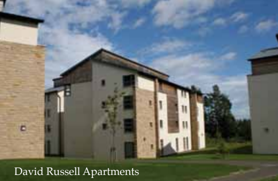
David Russell Apartments