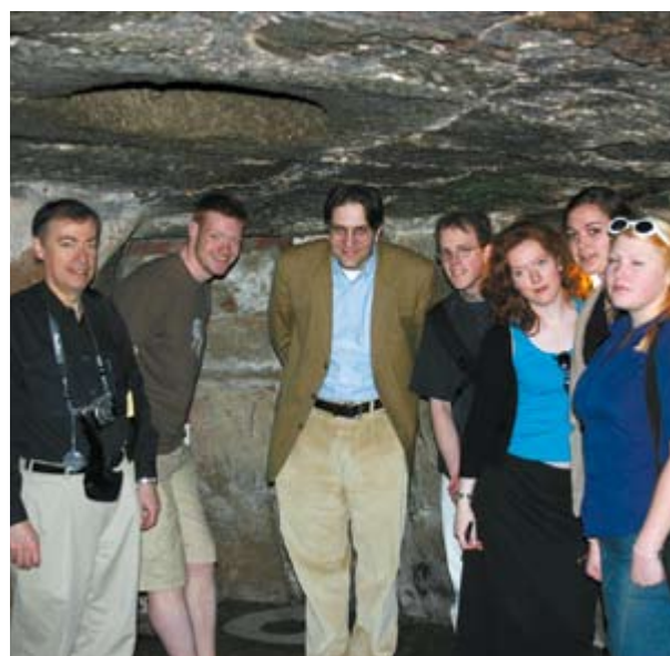
Staff and undergraduates visiting the Mamertine prison in Rome, traditional site for the imprisonment of Peter and Paul, during a study trip.

The normal Honours programme in New Testament consists of four modules. One of these, Biblical Exegesis , includes the careful study of New Testament texts. A second module is selected from a set of options that use Greek language in relation to important New Testament writings. A third module allows a free choice from a wide range within the field of Biblical Studies (see table on page 102). The fourth module gives you an opportunity to write an Honours dissertation or research paper on a subject of your choice in the New Testament field, unless you elect to do a dissertation in the other Honours subject of your Joint Honours programme.